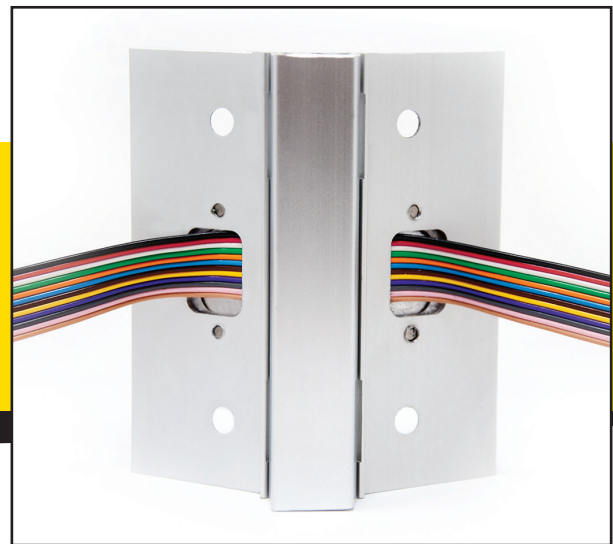
CE-12EA Back View