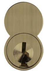
606 Satin Brass