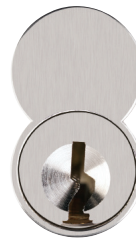
626 Satin Chrome