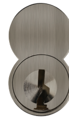
613 Oil-Rubbed Bronze