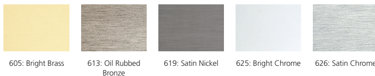
605: Bright Brass 613: Oil Rubbed Bronze 619: Satin Nickel 625: Bright Chrome 626: Satin Chrome